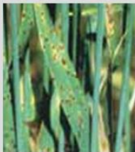
Spot-form Net Blotch