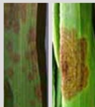
Physiological Leaf Spot