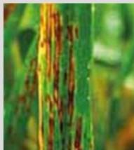
Net-form Net Blotch